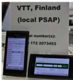
Research: IVS and PSAP on a Mobile Phone