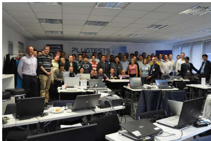
Group picture in test room